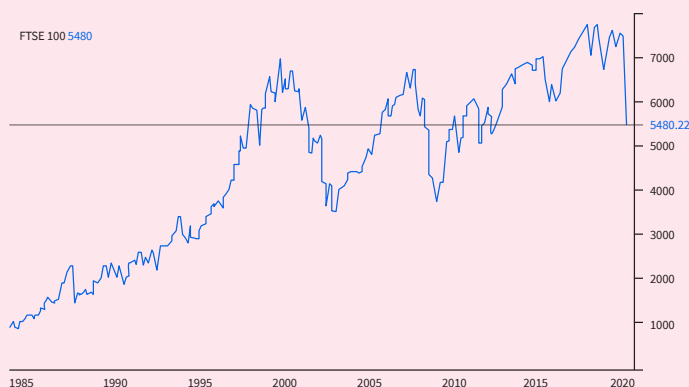
Chart: FTSE 100 from inception to March 2020

Created in 1984 with a starting level of 1,000 points to provide a wider index of leading shares quoted in London, the FTSE 100 largely superseded the narrower Financial Times 30-share index launched in 1935. As a barometer of economic outlook and corporate prospects, the FTSE 100 has gauged a few storms over the past 36 years. A chart of its progress reveals a plethora of spikes and dips, the starkest of which can be associated with key events in recent financial history.